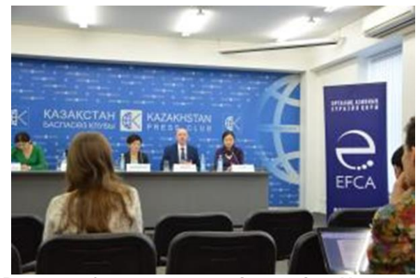
Press conference announcing project Nov 2013

Although this problem has many causes and effects, EFCA defined it as a lack of "downward accountability" and designed this project to address this issue. This was not the original project proposal submitted to UNDEF. The original proposal was intended to create an NGO Expert Center that could help with NGO development. However that proposal was