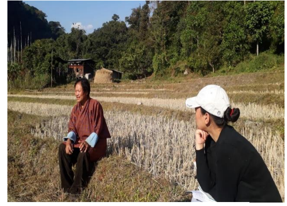
Rural Reporting Grantee during research work in Western Bhutan

community about what ethical standards should be expected from news and information providers. Setting and adhering to standards at least by some participants helped educate many other community members to press for trustworthy, reliable, and fair information from news outlets. Many community members admitted that whenever they see any state sponsored advertisement or policy related