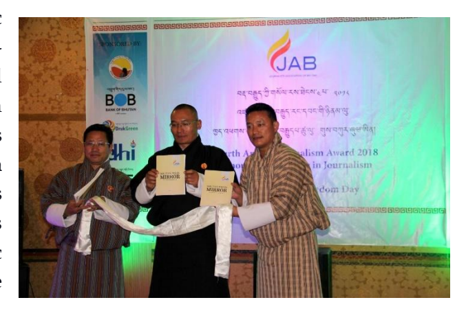
Former Prime Minister, Bhutan during the launch of Bhutan Press Mirror, Issue II

media persons who wrote on specific issue, were distributed among decisionmakers, academic institutions, local governments, and opinion leaders. Through R9 and R12, JAB was able to establish a critical mass of media professionals of various genres across Bhutan that transcends the country's social geographical, and linguistic limitations. Its training modules have carved out a niche for the entire media professionals community and have been a reference point for other training programmes.