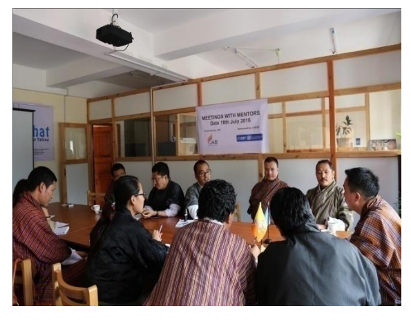
Meeting of Mentorship Programme

with improved skill sets. Some mainstream media persons during the interview named male and female reporters and a few rural community members stated that, post-training, they had developed an innate ability to identify news and report on it. The interviewed female reporters appeared confident in their ability to cover and report on local events. During the interaction, many members of the local media community agreed that the capacity-building programme gave participants a professional advantage.