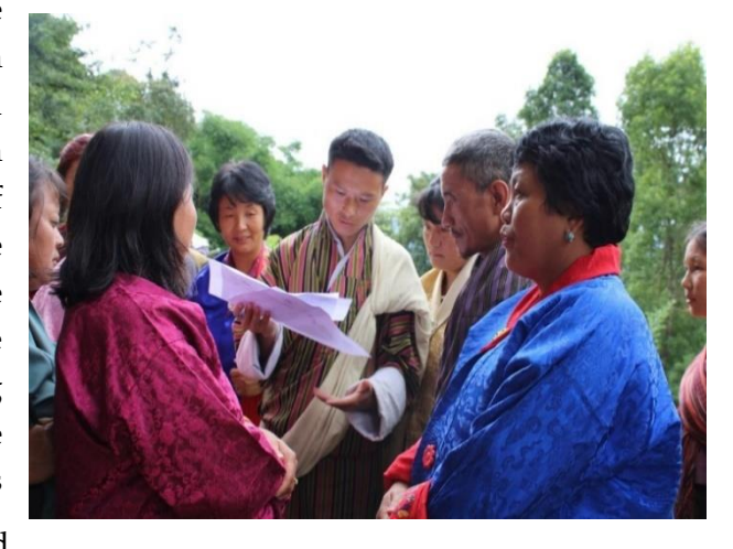
Meeting of the Community Media Forum

Interviews with the beneficiaries and the grantee during field visit provided an insight into how the project has impacted them as a beneficiary and as an implementing agency. The impact of Covid-19 has immensely affected the planning of JAB as it has affected the availability of resources for everyone including JAB. The grantee was expecting the country's economy to pick up and the donor organizations to receive more funds