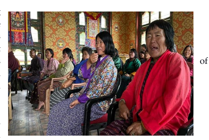
Participants in the workshops for Citizen Journalism and Social Media in Bardo Gewog in Zhemgang