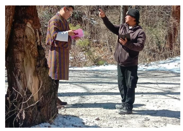
Field visit of the participants during training of the Long-form story writing

Capacity Building: From Practice to Praxis: During the interviews, the beneficiaries spoke about expanded understanding and the use of new technical production abilities. Some senior journalists hosting talk shows on radio and television admitted that the training helped them understand how to identify issues, perform in-depth research, ask proper questions to the relevant parties, and pursue them strategically to get them to commit and end with an inclusive note.