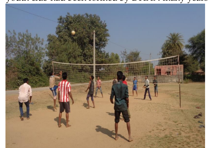
Youth Association, Rajasthan

The evaluator met one formal youth association and heard of their involvement in setting up a blood donation event and awareness-raising on elections. Other evaluation meetings with youth comprised of informal groupings whose links with the UNDEF project were unclear. For instance, one interviewee spoke about being part of an informal youth club which had existed in his village for years. DHAN then got involved and provided training for them to continue doing the community works that they were already carrying out. Another group said that their youth club had been formed by DHAN many years previously (before the project) and that