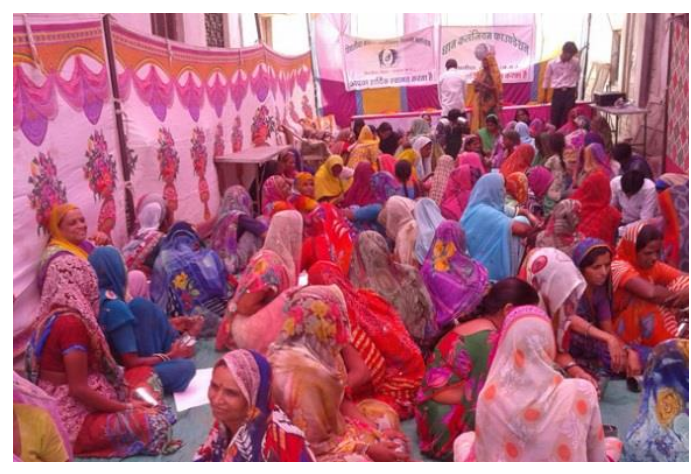
Self-Help Group Meeting, Madhya Pradesh

The group demonstrating the least change in capacity were the SHG s. Project staff shared impressions of change but were unable to support these with objective data (e.g. pre-or post-training event questionnaires) to prove the outcome indicators of 80% of women performing democratic practices (1.1.1.) or 65% participating in village council meetings (1.1.2) because of the project.