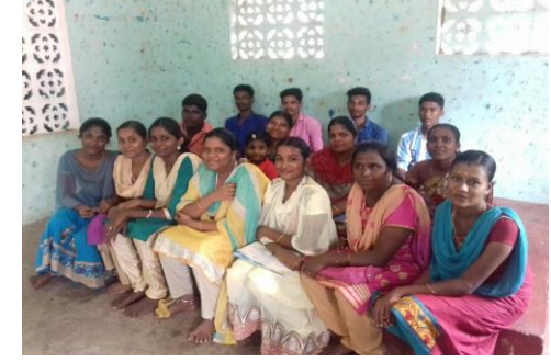
Evaluation Meeting with Students and Youths

reliance and alleviate poverty. DHAN works in 14 states in India and reaches 1.7 million families through several programmes involving community banking, agricultural development, coastal conservation, information technology for the poor and the 'Working with Panchayets Programme' which encompassed the UNDEF project. DHAN also comprises the Tata-DHAN Academy, an institution for professional Development