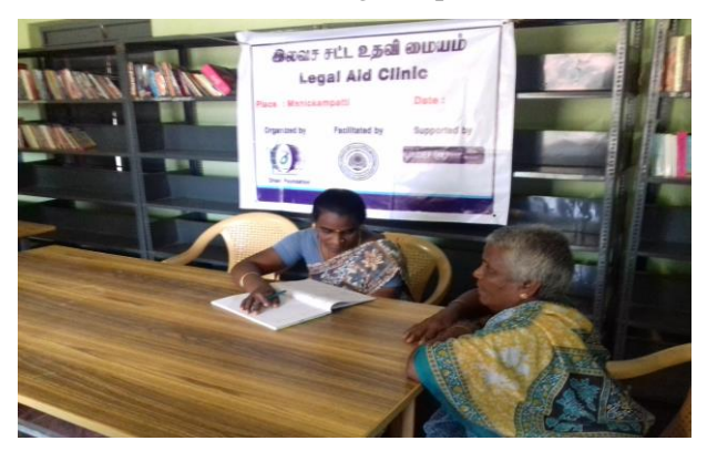
Evaluation meeting with para-legal aid beneficiaries

The evaluation meeting with paralegal volunteers and beneficiaries heard a number of outcomes from legal support in terms of villagers obtaining birth and death certificates, pensions, and subsidies for drip water irrigation. Beneficiaries who participated in the paralegal training reported increased confidence and new knowledge. The Micro-justice intervention made a large impression on beneficiaries and was repeatedly mentioned in