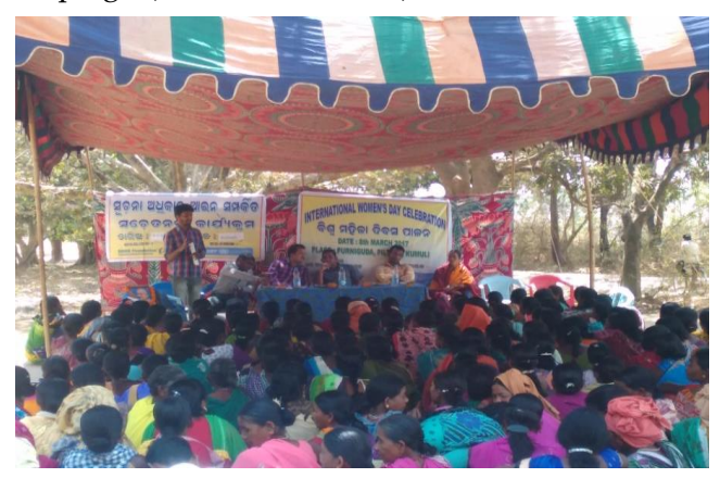
Right to Information Act Campaign, Odisha

heard directly from beneficiaries on this; for example, one man said he had been applying for an education loan for his son for a long time and only obtained it after petitioning under the RTI Act. The targeted number of activities were carried out (2.2.1) but it is not realistic to expect evidence showing that 70% of 50,000 people increased their awareness as a result of project activities (2.2.2.) given the difficulties in measuring effects on indirect beneficiaries with whom the project has no on-going contact.