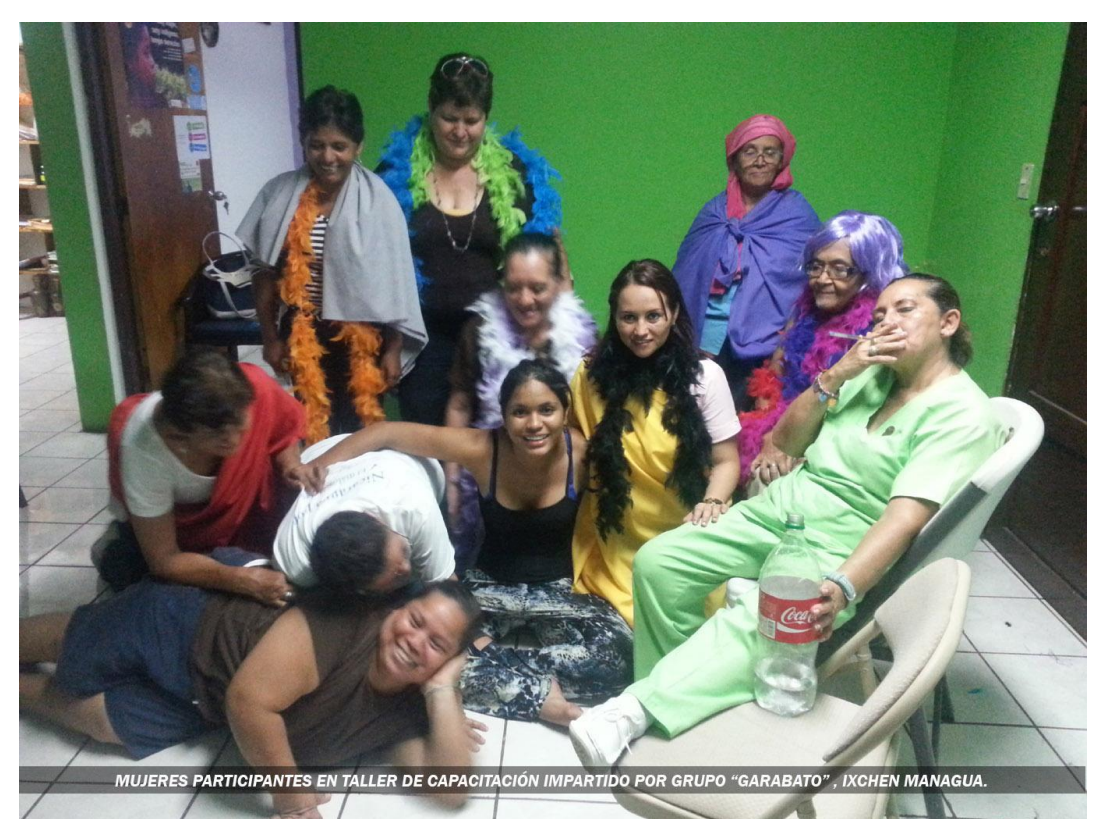
Women participating in a capacity-building workshop conducted by the "Garabato" group, Ixchen Managua.

and the added value generated by them. This exercise should show how (a) the use of theatre as a tool to promote grass-roots organization processes; (b) the use of a highly participative methodological approach and (c) processes of capacity-building bases on specific topics raised by the participants themselves were linked up. In order to ensure that the methodology to systematize experiences sharing echoes and disseminates widely at the groups and individual levels, it would be important to select the most appropriate means to display them while taking into consideration the specificities of the different contexts, including the cultural dimension. (See conclusions v and vi).