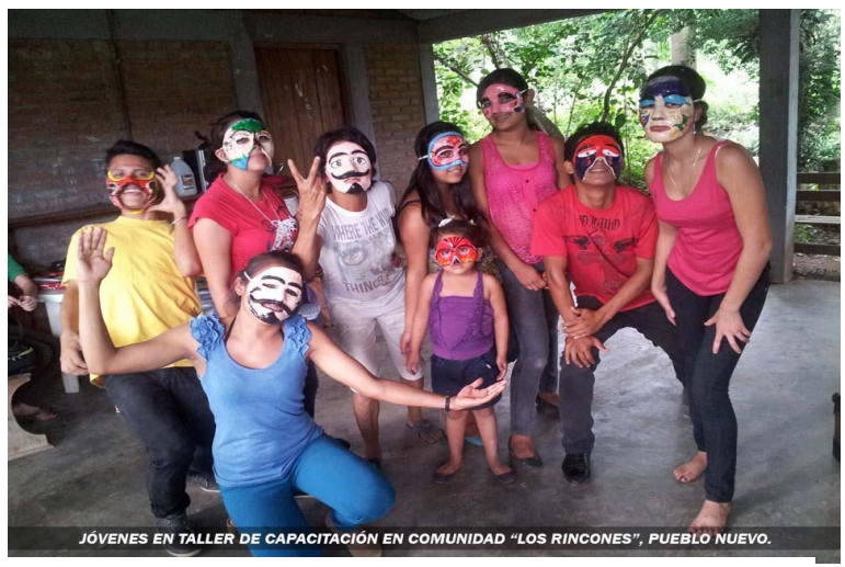
Young people in capacity-building workshop in the community of "Los Rincones", Pueblo Nuevo.

The UNDEF project provided the opportunity to show how art and popular theatre can be used to promote organizational processes, mainly with women and young people, in suburban and rural areas. The added value provided by this project contributed to promoting this innovative approach and strengthening the institutional capacity and presence MOVITEP-FS in the municipalities of intervention, including on the Atlantic coast where indigenous populations live. Furthermore, the benefit by developed provided the