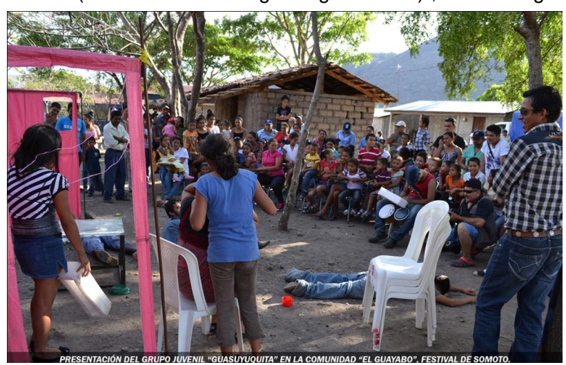
Performance by the youth group "Guasuyuquita" in the community of El Guayabo, Festival of Somoto

This legal set-back revitalized the work being done by women's organizations who for decades now have been conducting advocacy work to prevent gender-based violence and push for an improvement in legislation surrounding human rights. As a result of this process, the national assembly adopted in February 2012 Law 779, the "Law on violence against women" and a reform of law 641 in the penal code which represents the specific normative corpus dealing with the protection, reparation and sanction of all forms of gender-based violence. The entry into force of this law has provoked a strong debate throughout all of Nicaraguan society with some strong resistance coming from conservative and religious sectors which hold a lot of power in the national political landscape. Women's organizations considered this law to be a considerable advance, until it was reformed by presidential decree (decree no. 42 – regulating Law 779)<sup>7</sup>, introducing the concept of mediation as an