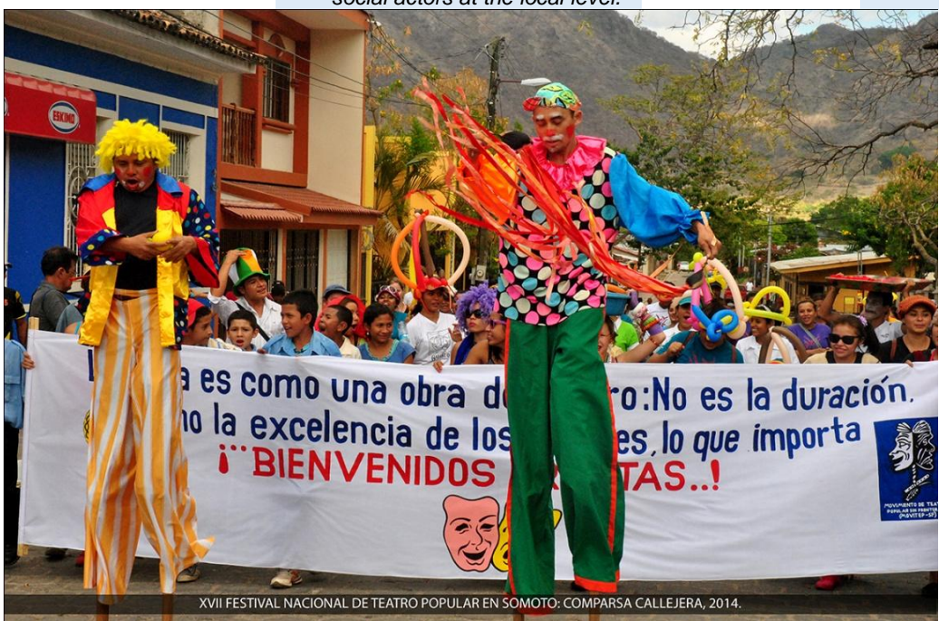
XVII National Festival of Popular Theatre in Somoto: Street performance, 2014

- Stronger links and collaboration between the social actors at the local level.