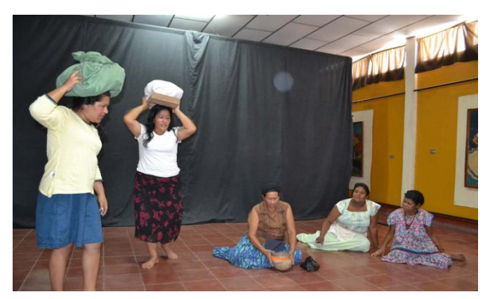
Mystical women of the "Lapta Yula" theatre group of Bilwi, Caribeban Coast during the Estelí Festival

possibility of jointly constructing the production and performance of theatre plays based on their own experiences allowed them to positively integrate the messages they had worked on. However, in some cases there existed the risk that the content and language of the performances suggested by the group focused too strongly on negative and violent experiences. By including more positive messages about masculinity in the performance elaboration process it was possible to show that "other