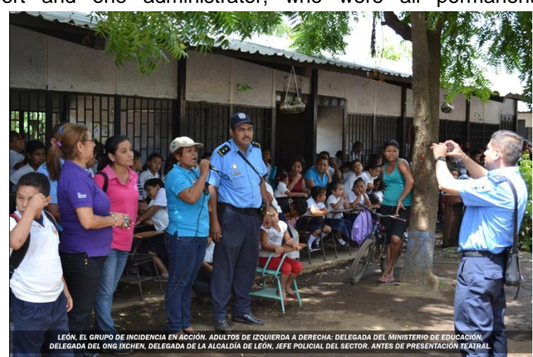
León, the Advocacy Group in action. Before a theatre performance.

MOVITEP-FS staff)<sup>13</sup>; and of the Coordinators of the 13 theatre groups in the various locations of the intervention. The National Coordination Team carried out periodical meetings in order to supervise and adjust the planning and the implementation of the activities (two days/once a month). The Executive Team met at least once a month or more often when the need arose. The project also established collaborative relationships with about twenty women's rights organizations working on the topics of domestic violence in the various locations.