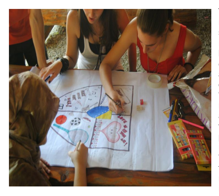
Summer camps joint activities in Brčko city

Project documents and reports demonstrated that all activities were well organized, coherent and extremely effective. The youth summer camp was organized to reward students' efforts made in schools but also to enhance the quality of human rights practices. The teachers training methods and modules delivered to all teachers at the end of sessions facilitated the human rights and democracy curricula taught, as well as the other subjects taught. This methodology recognized as quality standard, enhanced directly the modernization of all pedagogical methods, in accordance with the Bologna Process.