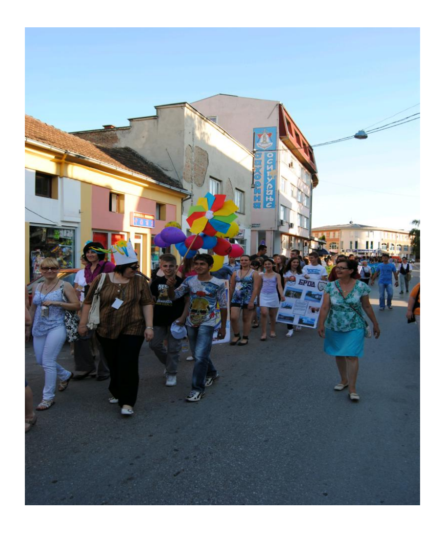
Summer camps defile into Brčko city