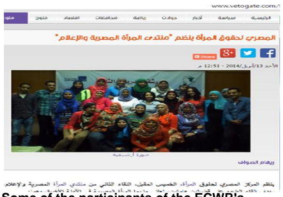
Some of the participants of the ECWR's forum on the Egyptian women and media

ECWR faced a number of problems when formulating the project in 2012. As a result of the revolution, the Egyptian administrative apparatus governing NGOs operating with foreign funds was virtually frozen. ECWR's response was to form a consulting company, ACO, which could legally accept funds to implement projects. This arrangement was discussed with and accepted by UNDEF. ACO and ECWR are, apart from separate legal personality, the same organization and the somewhat unusual institutional setup raises no red flags.