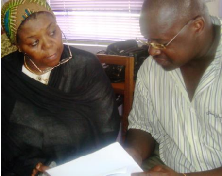
Workshop in Mombasa

During the life of the project, stories being generated by journalists and NGOs, as well as through freelance commissions and from AWC staff, were featured in Kenyan Woman . This was distributed on-line through