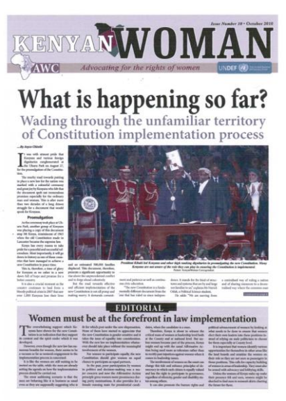
Kenyan Woman issue 10

This project was conceived and implemented at a crucial moment in Kenya's democratic history, as a new Constitution was moving towards promulgation, laws were being reformed and the injustices of the past were being addressed. The project in many ways was 'of its time', however the project's actions and outcomes continue to be relevant as Kenya enters a new era of implementation and consolidation. Already ACW has shifted the focus of its work for women's rights to ensuring that they are fully considered as the Constitution is implemented and as the anticipated elections approach. In this process, relationships with