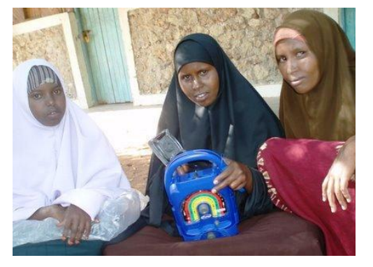
Women from the radio listening group in Garissa

The evaluators were able to listen to some of the programmes and found them informative and lively. However it is clear from the comments of a