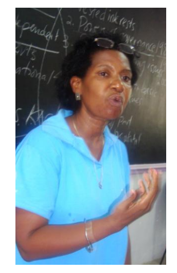
Media encounter in Mombasa

gender justice (regardless of the particular area in which they work) and not just because they were women's organizations. An NGO working on environmental issues, for example, that tried always to mainstream gender issues into its work, was seen as a good candidate for the training. Conversely, in planning the training AWC also tried to identify some NGOs that clearly should have a gender outlook but that did not, offering such organizations the opportunity to begin to take a gender-sensitive approach to their work. Finally, the "reach" of the NGO was taken into account when deciding whether or not to include them in the training, in order to maximize the impact. A small local NGO that had close working relationships with a national organization, for example, would be given priority ahead of a large community organization that had no wider reach. AWC also insisted that the NGO representative sent to the training should be working at programme level, in order to be able to fully contribute.