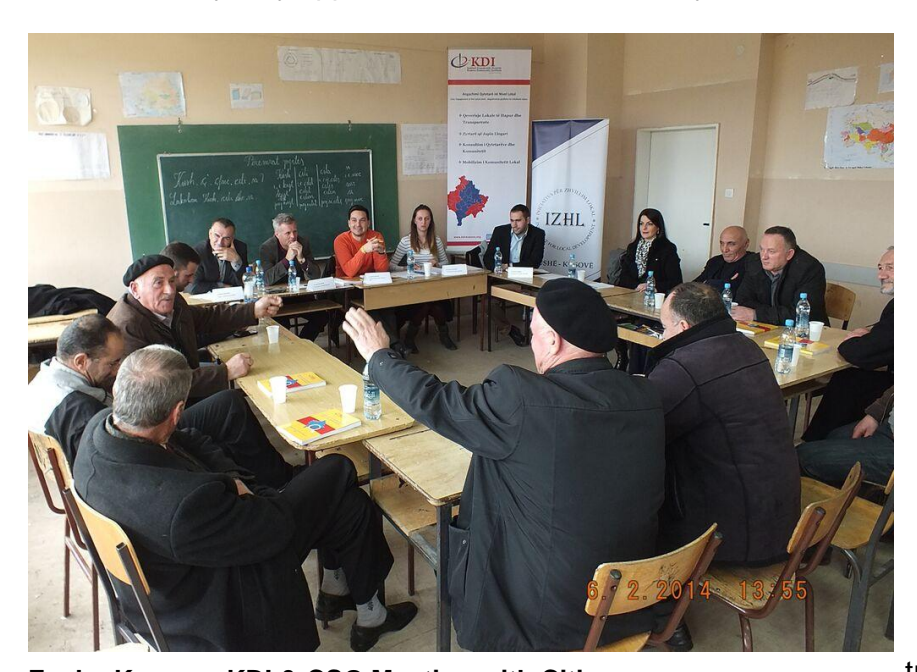
Fushe Kosova: KDI & CSO Meeting with Citizens

An initial examination of the project design and results framework leads to an appreciation of the fact that KDI had been quite modest in considering what the project might accomplish within its two-year timeframe. A more considered assessment, taking into account the short history of decentralization of governance in Kosovo, along with the limited size and capabilities of civil society, particularly at local level, yields an understanding that achieving the outcomes specified, modest as they may appear to be, would be no easy matter.