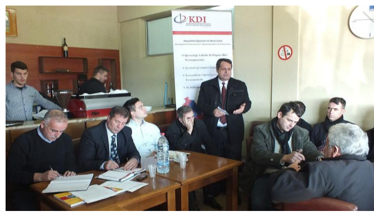
Town Hall Meeting in Viti in 2014

Certainly, the project broke new ground and could form the foundation for further, more sustained initiatives in the same field of activity. The urgency of the need for further work over a longer period to build accountability and transparency at local government level was amply demonstrated through the project and its achievements, as well as the limitations to what it was able to accomplish.