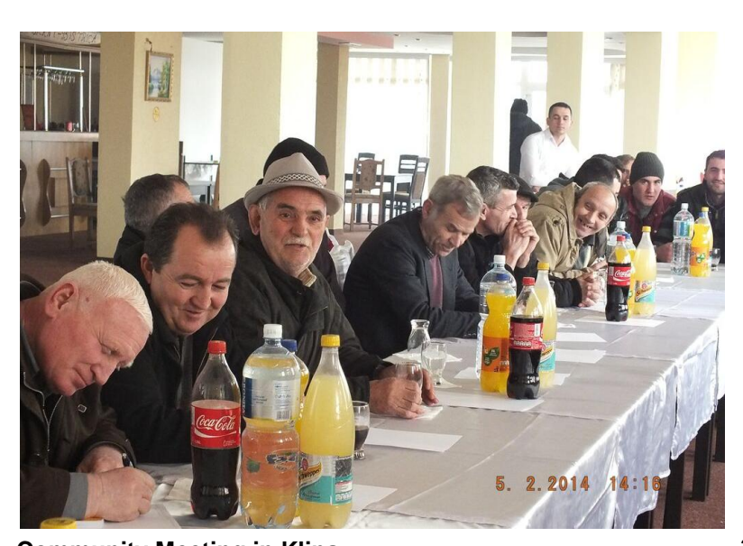
Community Meeting in Klina

Under performance evaluation, the monitors assessed the quality of work of the Mayor, Head of Assembly and individual members of the Assembly, as well as the MA and municipal government as institutions. Statistics were provided on: decisions made, whether that they were debated, or vlamis given rubber-stamp approval; on the attendance record of individual Members of the MA and their level of activity in major community meetings. As noted above, and of critical importance, a detailed review was also provided of promises made by the mayor and the governing party, practical action taken to implement what had