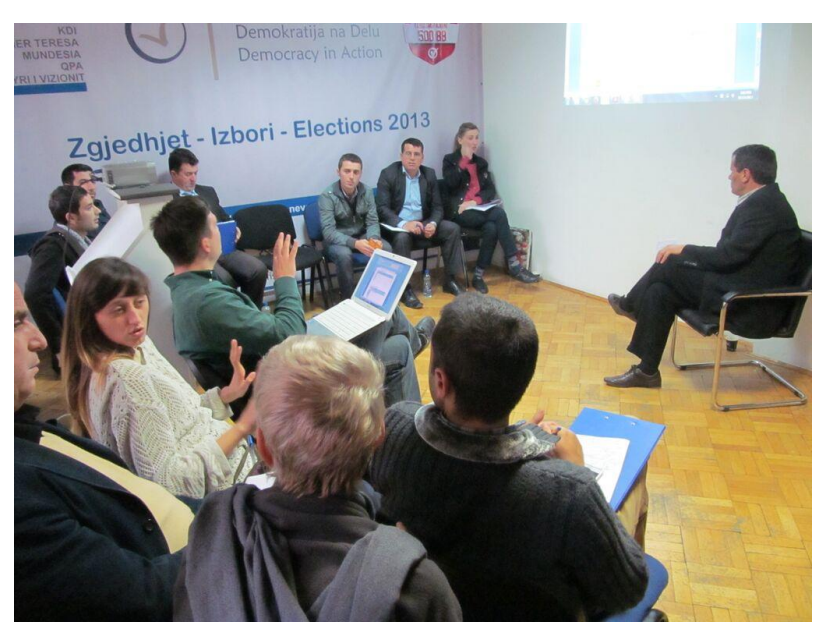
CSO Advisory Group Meets at KDI

ELITA has substantial experience in working in the municipal government sphere and has worked in this field since 2001. As in Decan , the CSO is regarded as an asset and essential resource by local government, with more knowledge on municipal procedures and core substantive sectors than most elected and appointed officials. As the representative of ELITA commented to the evaluators, "this organization is regarded as an extension of the local government, providing it with guidance and advice." In the predominantly Serb municipality of Gracanica <sup>20</sup>, the partner CSO, Serbian Democratic Youth, has established a position of trust which transcended the transition from one Serb governing party to another in the 2013 local elections. In 2014, the organization was asked to advise the municipal government and MA on the regulations on citizen participation. At the request of the municipal government, it also took the lead in the drafting of a youth strategy for the municipality.