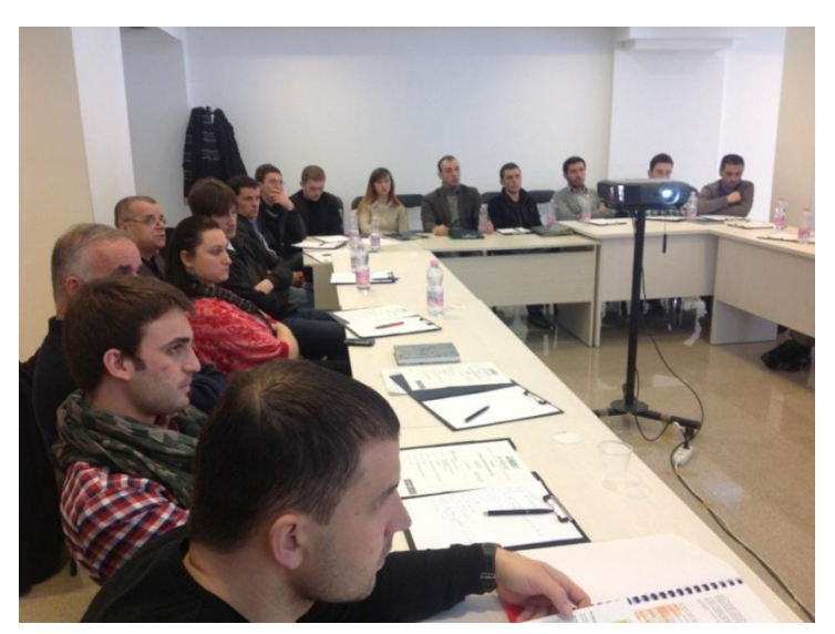
CSO Training Session

A further output of the Advisory Group sessions during 2014 was development of advocacy action plans, developed by each member organization. Preparation for the development of the action plans was facilitated by a 2-day training workshop, held in Decan in February 2014, to consider the key advocacy issues which had emerged at local level (see discussion, above, of Outcome 2), and focus the topics for the Issue Papers. By the conclusion of the training, a set of guidelines had been developed, setting out the steps to be followed to refine and implement the action plan around the topic selected. KDI then offered financial and technical support to the CSOs in