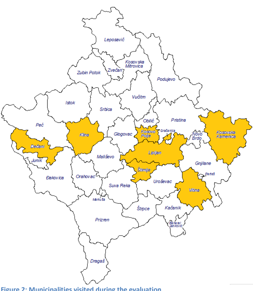
Figure 2: Municipalities visited during the evaluation

The field mission proper took place between May 25 and 29, 2015. The mission began and concluded with detailed meetings with the KDI team in Pristina on Monday and Friday morning, May 25 and 29. For the remainder of the time, taking advantage of the fact that Kosovo is a small country, the evaluation team travelled by car on field visits to a long list of project locations: Fushe Kosova: Gracanica; Shtime and Lipjan; Klina; Decan; Kamenica; and, Vitina (also known as Viti). This itinerary provided the evaluators with the opportunity to meet with a large sample of the CSOs and Heads (or Chairs) of Municipal Assemblies involved in the project, as well as some senior municipal officials. Initial plans also included visits to Gjakova and Skenderaj. However, these stops on the itinerary were cancelled as a result of the non-availability of key interviewees at these locations during the week selected for the field mission.