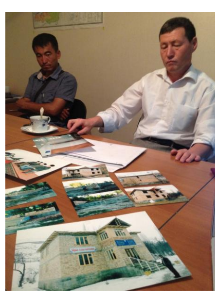
In Sary-Chelek county a DP was agreed to build a community info and service centre

Evaluators, however, had difficulties to confirm that the project's development pact monitoring comprised of two separate mechanisms, as initially foreseen and reported by the grantee and also presented to evaluators. Instead of a process in which the VCCs and the local authorities, each in close collaboration with TIK, elaborate their own assessment of a DP's implementation progress, evaluators positively noted a joint preference for a rather practical approach in the form of collaborative monitoring, in particular to assess the quality and completeness of construction services provided by contractors.