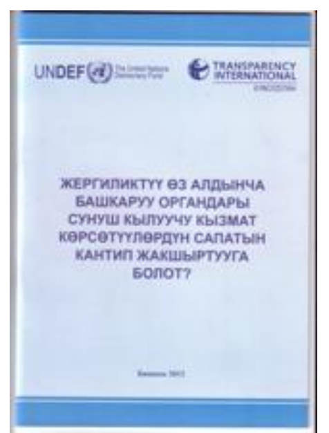
The project's handbook on public participation continues to serve as a reference guide

The project's joint training for local authorities and civil society was held 41 times (planned: at least once in 16 locations). Trainers confirmed to evaluators that many of the 875 (planned: 480 - 640) participants were unaware of the legal and administrative provisions and the opportunities for civil society participation in local governance. In their conversations with evaluators both local authority and civil society representatives praised the method applied during the training sessions, which assisted them in jointly identifying local development issues, setting priorities, and elaborating solutions and actions to address them together. Introduced to the DP tool and also provided with best practice examples of