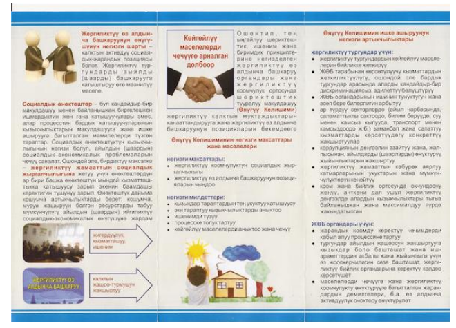
The project's Development Pact brochures provided a comprehensive introduction and clarified their purpose and function

The purpose of the joint training was to overcome the general lack of awareness, both on the part of local authorities and civil society , regarding existing provisions for democratic participation, which the survey identified as one of the reasons for limited engagement between local authorities and civil society. Apart from informing about the citizens' right to participate in local decision-making processes, the training was meant to encourage facilitation of the legally guaranteed access to information, which includes e.g. all aspects of the local budget, public procurement, and the management of land and water resources. Merging both types of local actors into a joint training activity was meant to prepare both sides for future constructive dialogue intended to lead to DPs and subsequent collaborative service efforts.