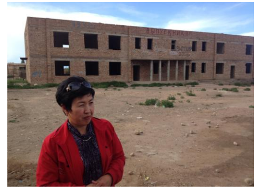
The head of Ton county presents a longtime abandoned school project the community decided to reactivate via a DP

overall screening of the VCCs' pact monitoring reports, which provided evidence that the gap between demand and supply of public services for the issues addressed by the project's DPs