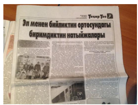
Press coverage of Emgek-Talaa county's DP implementation progress: Extension of the local kindergarten

There is no doubt about the project's overachievements in terms of some of its outputs (most notably, the number of DPs and respective local communities served, as a consequence of a highly effective replication process). It is also encouraging that according to TIK 25 of the 30 villages, which participated in the project, continue to use participatory approaches in their local decision-making procedures. In addition, villages chose to establish and regularly update public information boards to provide citizens with better access to information. Considering these effects and the overall extent of the capacity building (36% beyond target) provided, evaluators are of the view that the project effectively