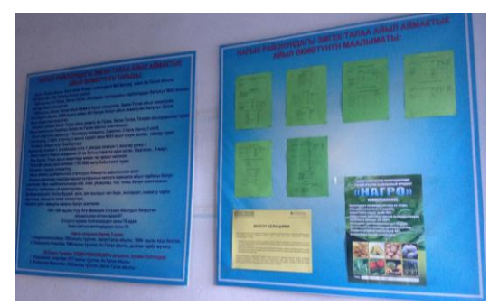
Example of information boards displaying development pact content and related monitoring reports in a municipal building in the Naryn region

Two separate development pact monitoring mechanisms finally were foreseen to allow both the VCCs and the local authorities, each in close collaboration with TIK, to elaborate their own assessment of a DP's implementation progress and