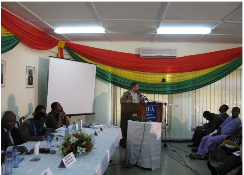
National strategy workshop, Ghana.

The most impressive project event was, however, the 14-19 March 2011 meeting in South Africa, essentially three meetings in one.