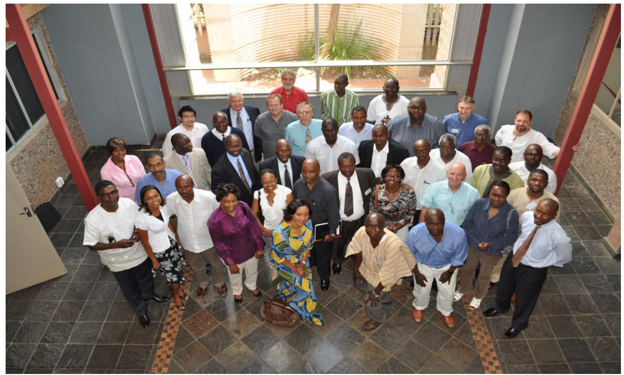
Group photo from the kickoff meeting, Pretoria, 2009.

This was a project that directly benefited the African democracy community, an elite. Would the money have been better spent at the village level on promoting the basics of survival? Nothing could be less clear. The people of Africa will benefit substantially from the strengthening of democratic rule on the continent. In this broadest of senses, the project was a sound investment of resources and relevant to the needs of the people of Africa, not just the small elite who were the direct beneficiaries. By promoting ratification and the coming in force of the Charter, the project also indirectly benefited the African Union.