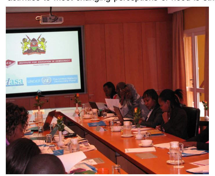
National strategy workshop, Kenya.

The willingness, and ability, of the project to shift funds between countries and adjust activities to meet changing perceptions of need is striking. Few donors would tolerate this.