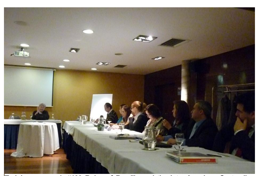
Training course 1: "100 Rules of Brasilia and the Inter-American System". Presentation by Cecilia Medina Quiroga, member of the United Nations Human Rights Council and president of the former UN Commission on Human Rights in 1999 and 2000. Judge of the Inter-American Court of Human Rights from 2002 to 2009.

The Manual on the Court's new Rules of Procedure, prepared by the project's technical team, was a key reference tool. The project sought to reach beyond the Latin American dimension to produce a real impact in the participating countries. This strategic approach was viewed very highly by the participants, who commented that it would have been