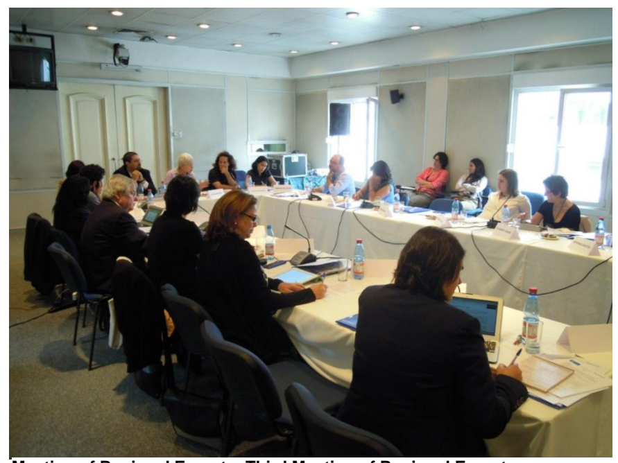
Meeting of Regional Experts: Third Meeting of Regional Experts: "Transparency, Fighting Corruption, and the Inter-American Human Rights System" (2011).

With regard to upgrading the professional skills of IADs and PDs, the evaluation team noted participants' view that the project had altered their perspective and work practices; they were now able to recognize more universal problems also found in other locations and recognize that correct interpretation of the law is essential for protecting and safeguarding the human rights of individuals. Some of the defenders interviewed commented that had they begun litigating before taking the course, they would have encountered problems, indicating that the training courses had provided a wealth of pertinent information that gave them a better understanding of how to do their job and significantly improved their performance. One of the Inter-American Defenders said that her participation in the project had been extremely useful for improving her standing before her country's Supreme Court, which has treated her with more respect since the training.