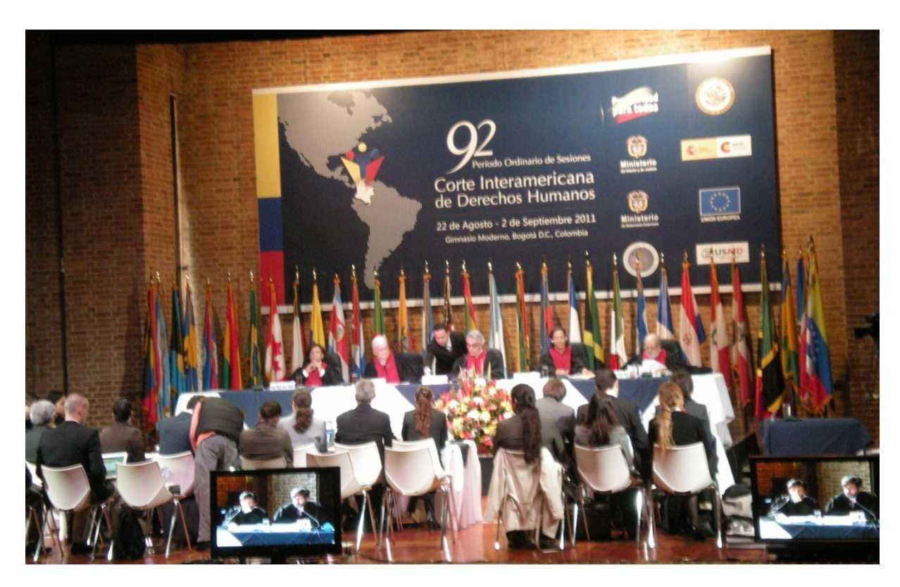
Course 3 "Training Course for Inter-American Defenders: In-depth Study of International Human Rights Standards." Experience and Exchanges with IACtHR Judges.