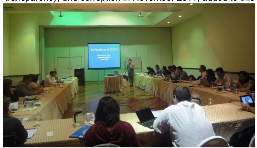
Course 4: "In-Depth Study of Procedures in the Inter-American System. Presentation of Oscar Parra, IACtHR member

Another component clearly contributing to the project's effectiveness was the instructional materials produced specifically for each course. These materials were rated very highly by the participants, who considered them excellent. The full contents of the semiannual courses were published in four syllabi: (i) the 100 Regulations of Brasilia and the Inter-American Human Rights System; (ii) the International Responsibility of States and Redress in the IACHR; (iii) Training Course for Inter-American Defenders: In-depth Study of International Human Rights Standards; and (d) In-Depth Study of Procedures in the Inter-American Human Rights System. The manual "Inter-American Human Rights System: Introduction to its Protection Mechanisms" (manual on the Inter-American System's new Rules of Procedure), which includes an update of a 2007 CDH study on the most important features of the human rights system in the Americas, was also published. The update includes the new reforms and changes in the IAHRS. The book Transparency, Accountability, and the Inter-American System described the discussions held among experts in human rights, transparency, and corruption in November 2011; added to this were the two programs for the