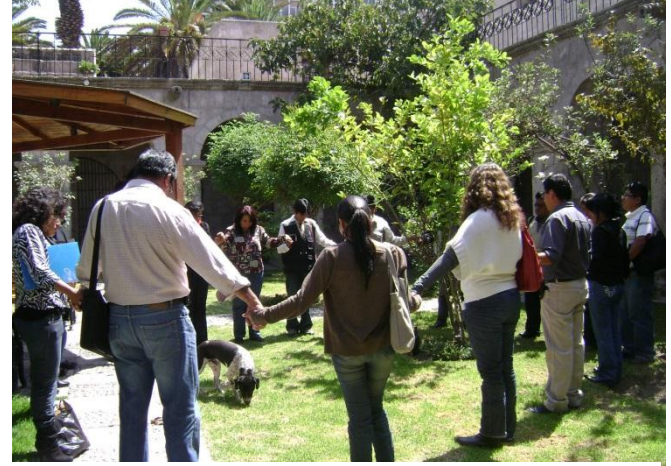
beneficiary Group work session. Workshop in Peru.

The selection of the project's nine countries and 17 beneficiary community radio stations was highly relevant to the social, political, and cultural context and the needs of the stakeholders and beneficiary