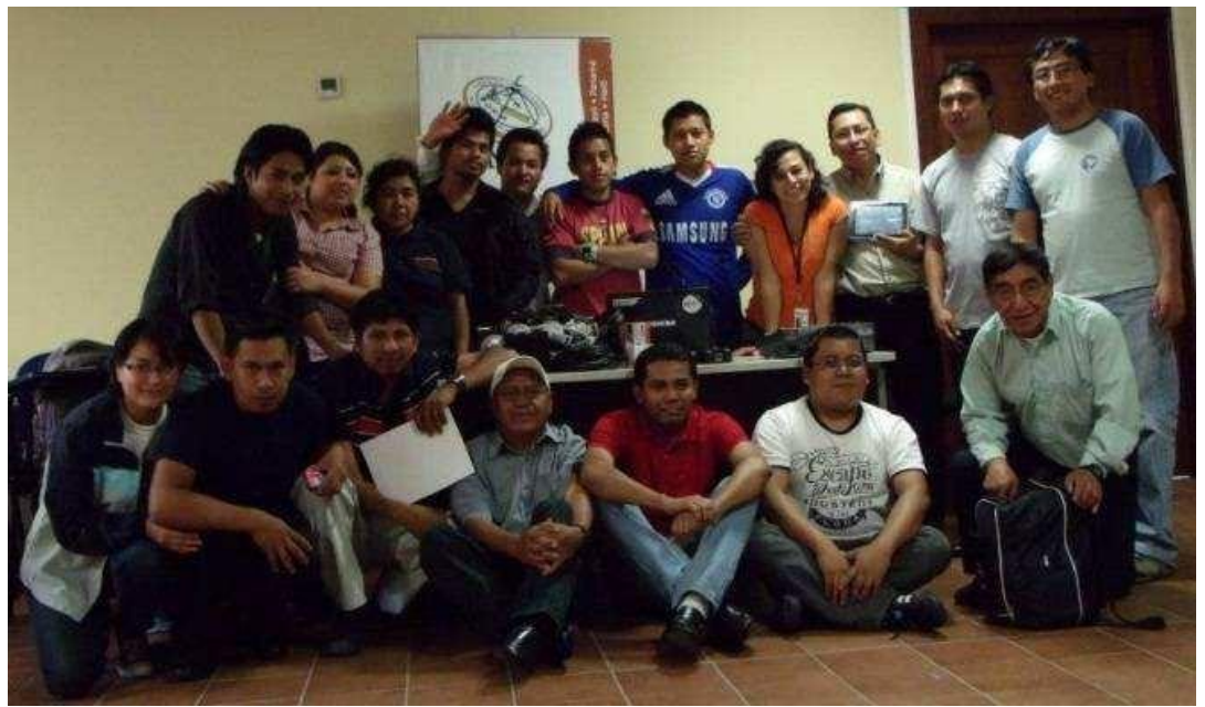
Binational workshop: Convergence for producing networked messages, Guatemala, April 2013