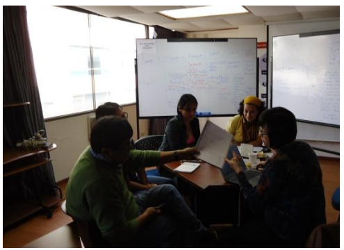
Debriefing with the UNDEF project coordination team.

provide the academic support requested. Universidad Andina does not offer distance education, only graduate-level courses; it therefore could not admit students with no university training. Furthermore, the National University Policy included new requirements for the accreditation of university programs leading to a diploma. Consequently, the course was designed but offered only in an on-site format. ALER is looking into alternatives to solve this problem and intends to design an accredited regional curriculum. Since only five of the 38 universities in Latin America that once had "communication for development" programs still do, such an initiative would be extremely relevant and necessary.