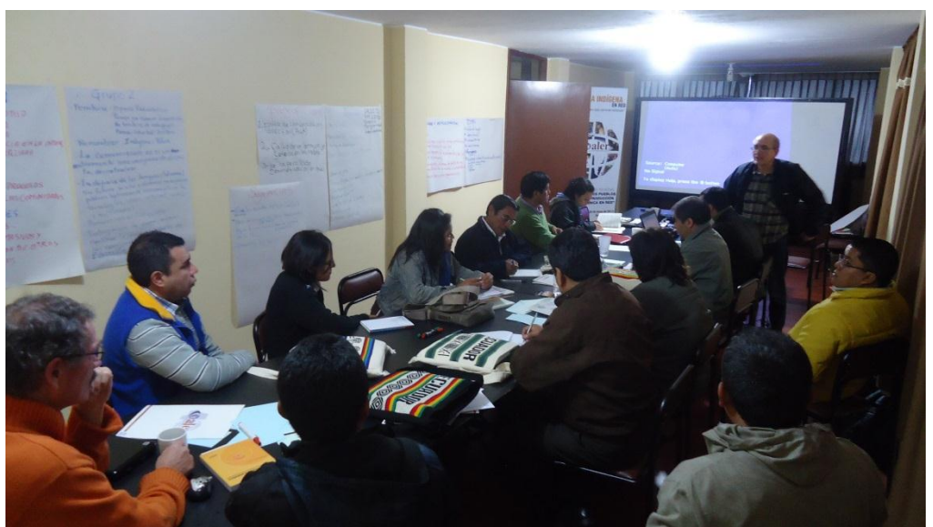
Regional workshop "Rights of Indigenous Peoples and Networked Radio Broadcasting," Quito, Ecuador, May 2013.

(vii) Explore alternatives that foster financial sustainability. There is clearly a need to intensify the use of diversified measures in searching for alternative financing to complement the funding from international cooperation. In the long term, this could include national government support for civil society projects and initiatives that promote the implementation of public policies. (See Conclusion viii)