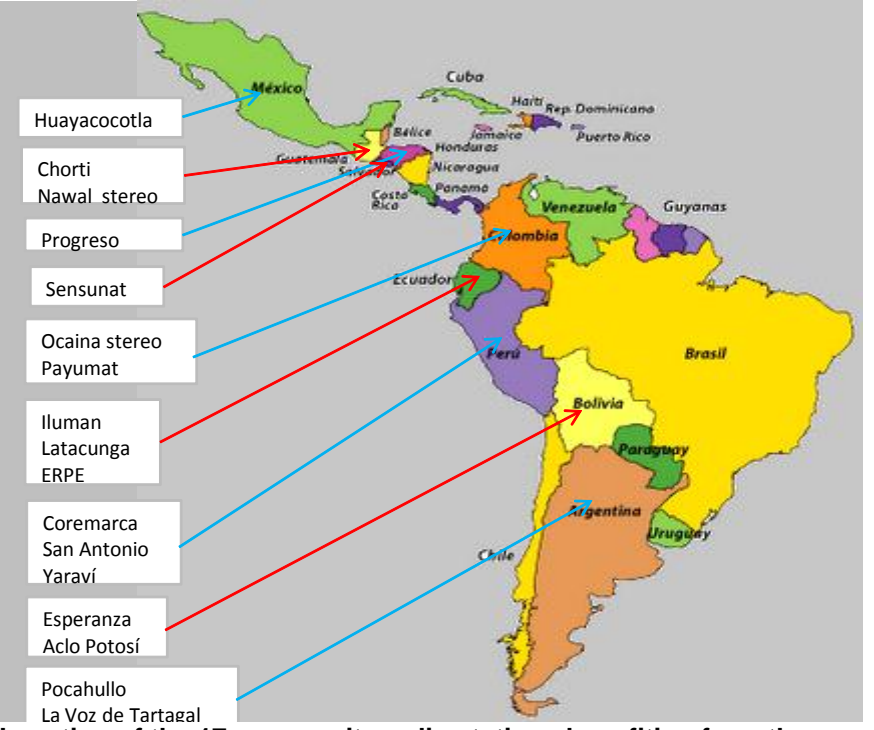
Location of the 17 community radio stations benefiting from the project

At the national level, the project benefited from the potential of community radio to create new spaces for citizen participation and bridge the gaps between marginalized groups and the local authorities.