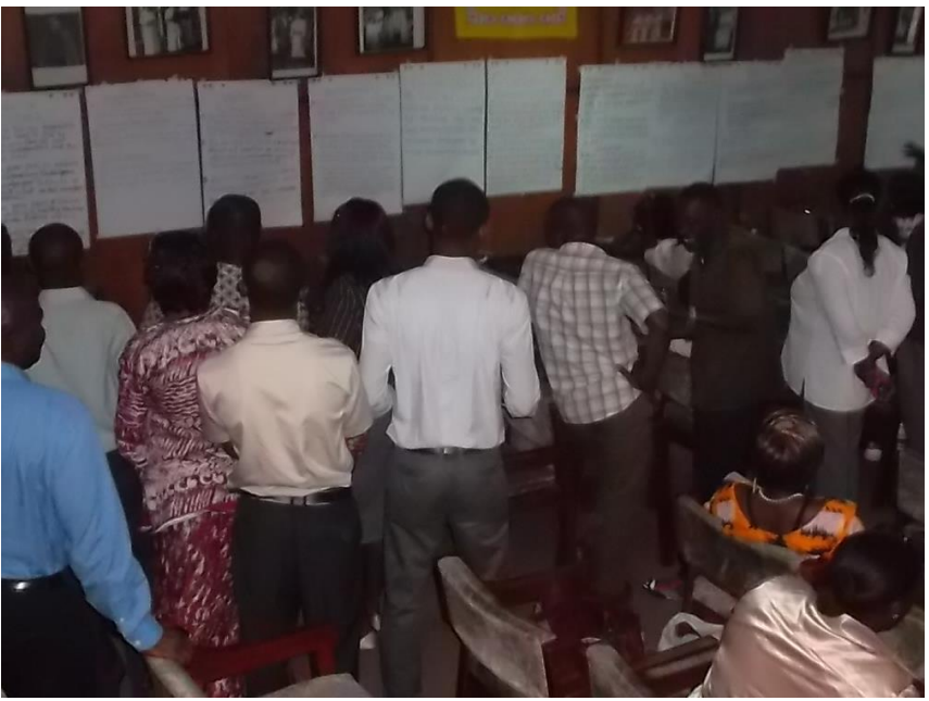
Strategy meeting, project launch, March 2013.

from the Ebola crisis and better define how CSOs can influence the political agenda at national and local level. This was the focus of the last meetings held by NMJD as part of the project.<sup>13</sup>