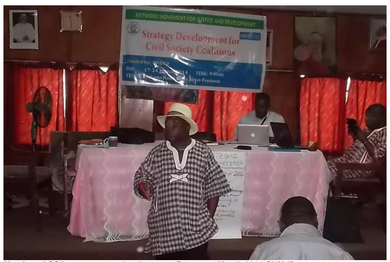
Meeting of CSOs on strategy development, Freetown, March 2014

Nevertheless, the project design differed in many important respects from a mere national version of the WSF. The key difference was that the Social Forum was only one component, alongside the – more fundamental – components that consisted in building management and strategic capacity among NGOs, and encouraging coordination within and amongst CSO platforms. The political risks related to this approach were identified: risk of misuse of the NGO movement by politicians during the 2012 elections, and risk of disagreements among NGOs wary of losing their identity if they join coordination bodies. As the evaluation will show, the latter risk actually materialized during the project period.