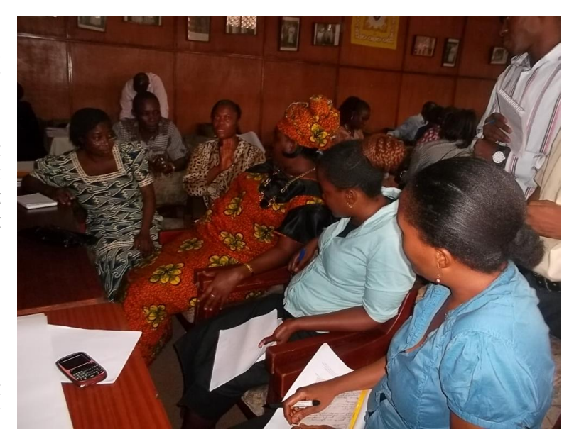
CSO representatives debate post-Ebola strategies, 2015.

The project was relatively efficient, in the sense that financial resources were mostly used as originally planned, despite the disruption caused by the EVD crisis and the resultina 11-months no-cost extension the project of implementation period. The project was also efficient in the sense that it reached a critical mass of NGO leaders, through training sessions and consultation meetings bringing together hundreds of activists, from the grassroots to the national level. This contributed to the added value of the project, as did the fact that many activities were deliberately outside Freetown: conducted though this bias in favor of provincial-based activities