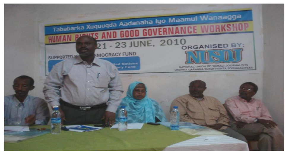
Opening session of the June 2010 workshop: speech by Ministry of Information Director General Abdirizak Bahlawi.