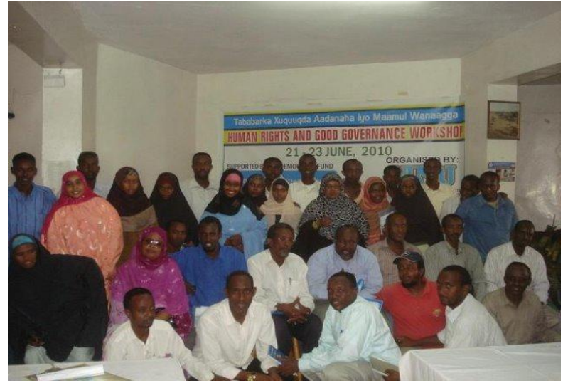
Participants at the June 2010 workshop (see box on p. 11).

The project mainly targeted NUSOJ journalists, and secondarily also benefited people who were not professional journalists but contributed information to radio stations and websites. The project document made no direct reference to owners, publishers or producers, although these are important stakeholders in their own right. Political leaders and government authorities were also not specifically addressed.