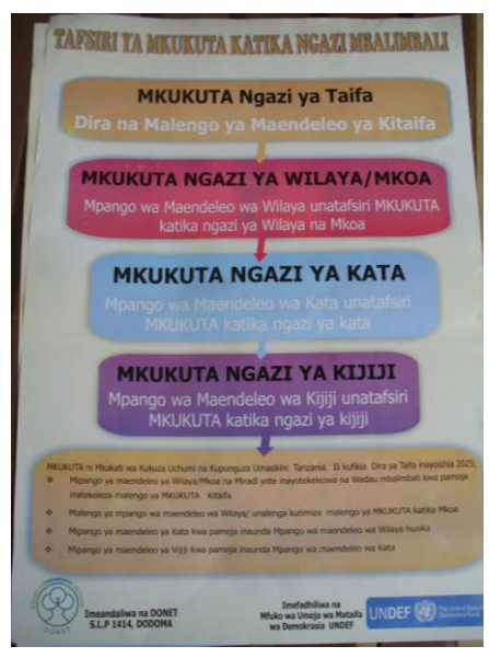
Poster clarifying the role of village, ward, and district plans for NSGRP implementation

(IEC) materials (posters and booklet-size trainer's manuals), which were designed to support the project's subsequent activities aiming to inform how NSGRP is supposed to function and support local development.