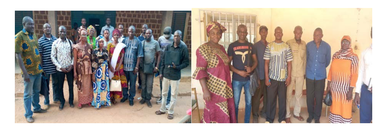
Members of AJEA with human rights groups in Bobo Dioulasso (L) and Dédougou (R)