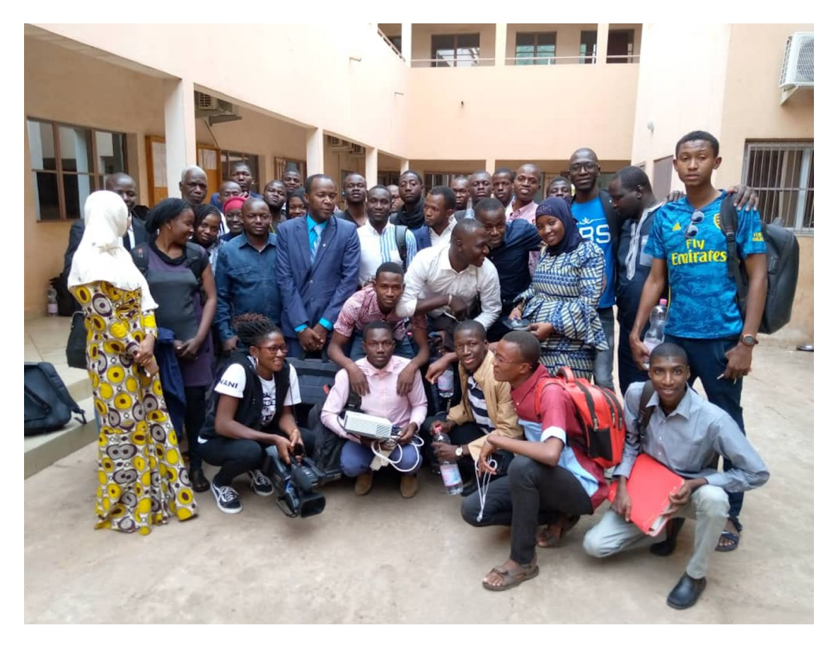
Journalism students at the ESJSC in Bamako, 11 March 2020