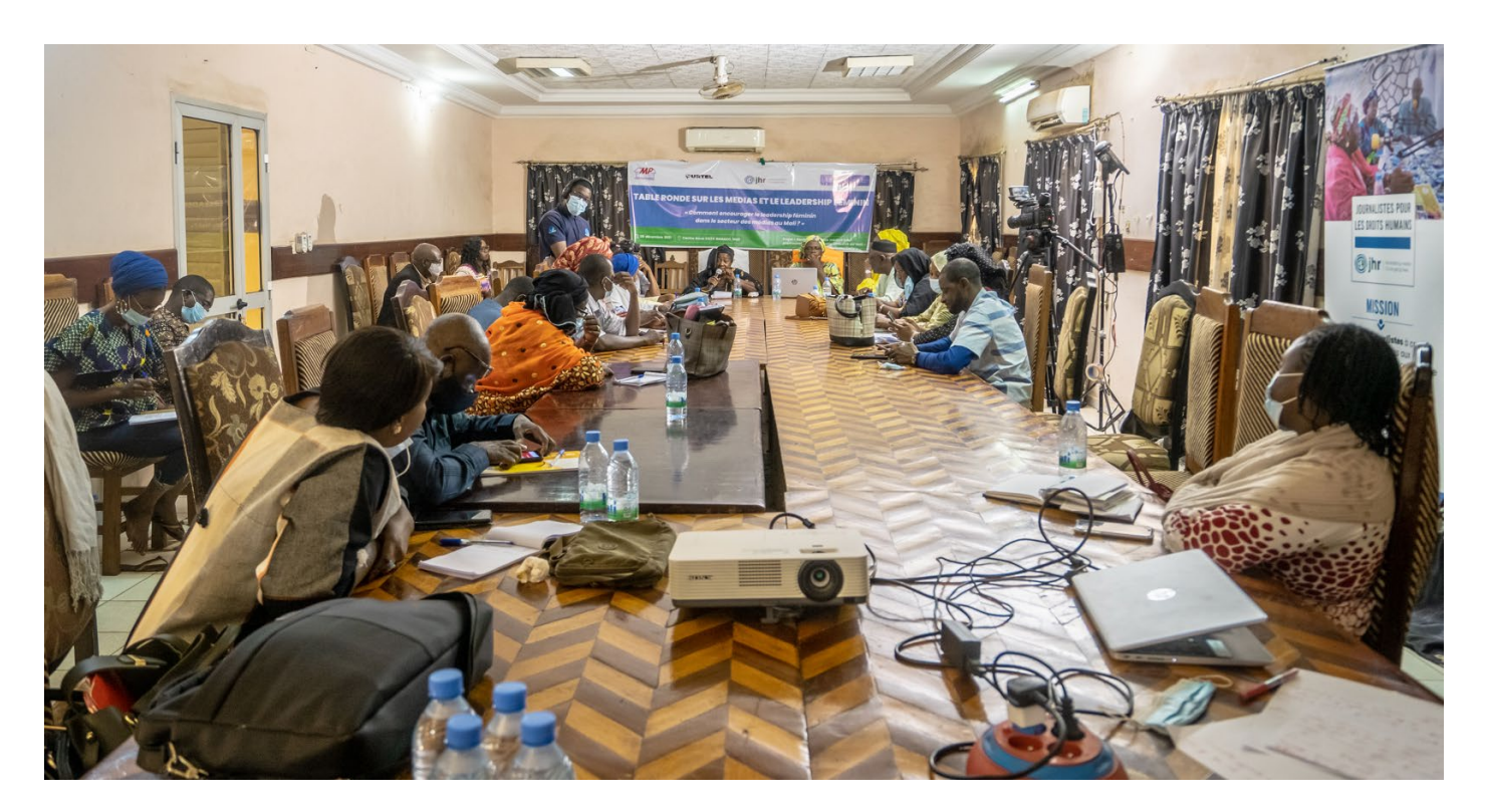
Roundtable discussion - Women Leaders in the Media, Centre Aoua Keita, Bamako, 8 December 2021