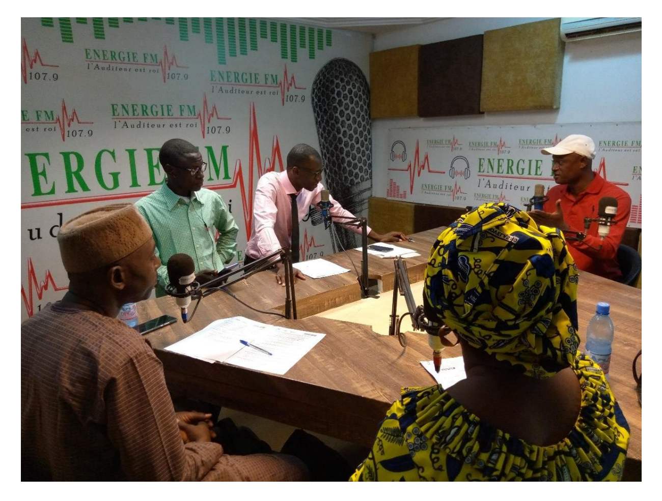
Radio broadcasting to facilitate access to COVID-19 related information for the deaf and hard of hearing, ENERGY FM, Bamako, 16 July 2020