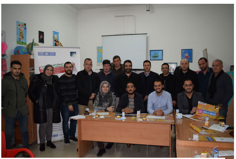
Figure 2: Awareness campaign, El Ikram association, Setif.

Although the project document proposes the integration of "participatory democracy for the sustainable development of the selected municipalities", it is necessary to rectify the terminology to assess the actual contribution of the project. The project's intended aim was to strengthen citizen participation in local development and to strengthen collaboration between civil society and state officials. In general, the project's strategic approach and the compliance with its steps as described in the logical framework contributed to its effectiveness.