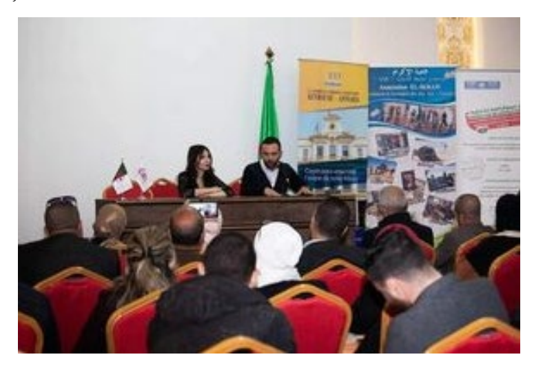
Figure 3: Local Governance workshop- Annaba March 27,2021

Significant delays and complications were caused by public authorities which refused to issue the required authorisation to carry out launch seminars and other project activities. Nonetheless, and despite all the aforementioned, outputs under the first outcome were considerably effective, as local stakeholders (associations and State officials) were greatly mobilised and continued to participate throughout the lifespan of the project, especially in Bordj Bou Arreridj, Annaba and Setif.