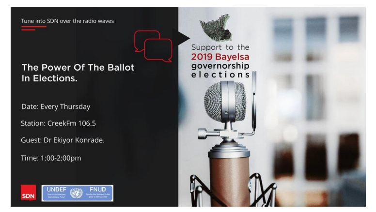
Flyer for Creek FM show discussing the 2019 elections.