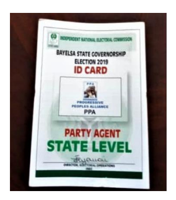
Example of political party agent ID card

The printing of 300 political party agent ID cards was delivered as envisaged, but it alone was unlikely to achieve the outcome of reduced electoral interference by political party agents. The database would have been a key additional tool for supporting post-election accountability and mapping where incidents of violence or malpractice did take place and could have been an innovative element with application in other states. Community members spoken to for this research regarded political actors as the key enablers of violence and conduits for vote buying on election day.