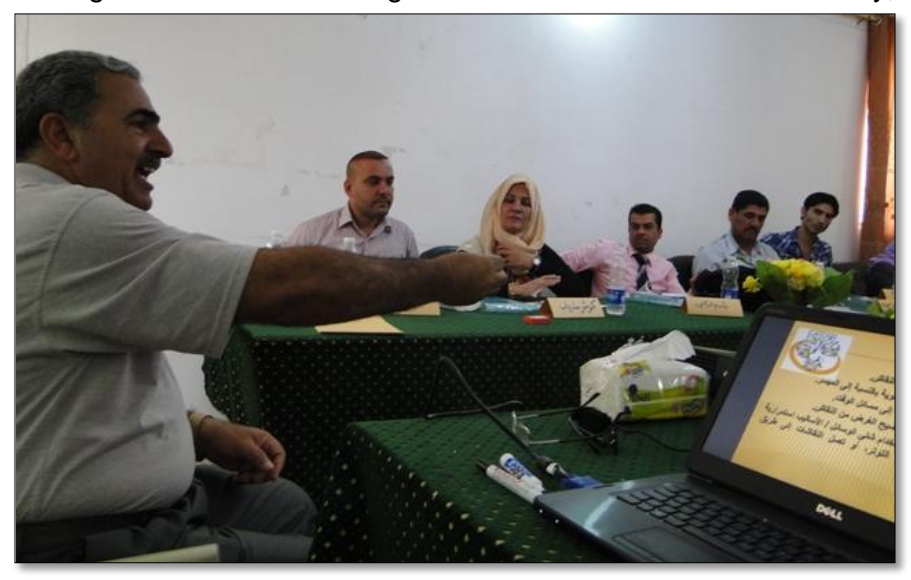
Facilitators' Training, Babil, June 2011

whether in security. electricity supply, garbage collection, or basic social services.8 According to UN data, 25 per cent of the population lacks access to safe drinking water, while a national survey conducted in 2011 found that 79 per cent of the population rated the reliability of electricity supply as very poor, with the average household receiving only 7.6 hours of electricity each day.9