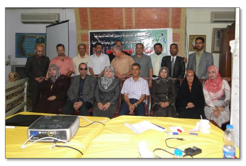
Facilitators' Training, Babil, June 2011

Overall, the activities delivered proved effective in providing beneficiaries with practical knowledge and hands-on experience in how to identify issues of general concern to their communities. It also built their understanding of how to bring such issues, along with proposed consensus solutions, to the attention of decisionmakers. Focus aroup participants from Karbala. Muthanna and DiQar, were positive about their experience project activities. of They explained that they had felt able to share concerns and problems