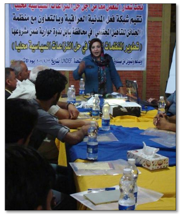
Babil Civic Forum, September 2011

A detailed examination of the budget suggests that, given the long list of activities completed and the complexity of relationships managed, salary and travel costs were entirely appropriate. The costs incurred for the planning and implementation of the public opinion survey, and for analysis and reporting on survey data were exceedingly low. Meeting costs represented a very high proportion of overall costs ($104,500 of a total project budget of $180,000, excluding $20,000 for UNDEF monitoring