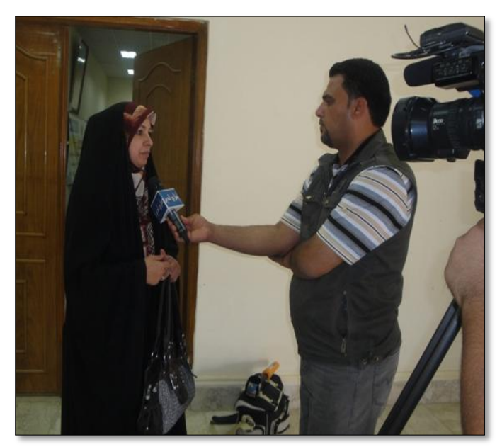
Media Interview with Panelist, Karbala Civic Forum, June 2011

communities, along with barriers to political participation and issues concerning alternatives to violence in dispute resolution. The findings were then utilized as a basis for establishing common ground and reference points in discussions, and for informing proposals taken forward into advocacy work.