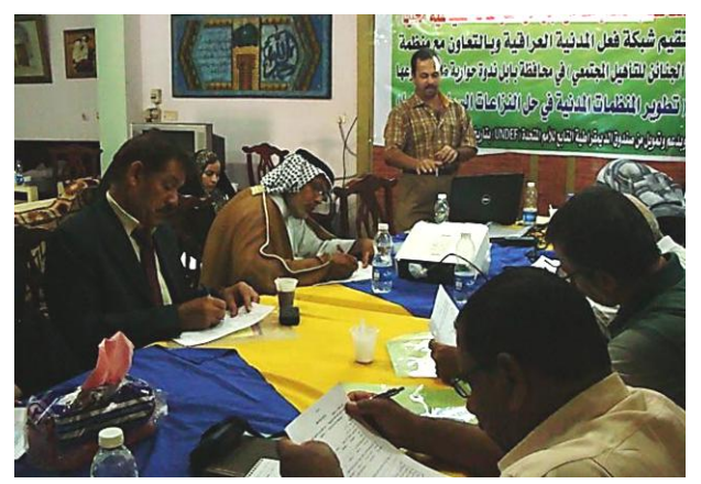
Babil Civic Forum

Quite understandably, all Iraqis are preoccupied with the constant threat of violence in their lives. An important contribution of the project at a local level, simple as it may sound, was to provide training and practical experience in negotiation, consensus-building and methods for finding common ground where disagreements occur. In this way, the project was able to demonstrate the effectiveness of non-violent methods for dispute resolution. The involvement of local branches of political parties in this process was of particular importance, given that many are linked directly to armed militias.