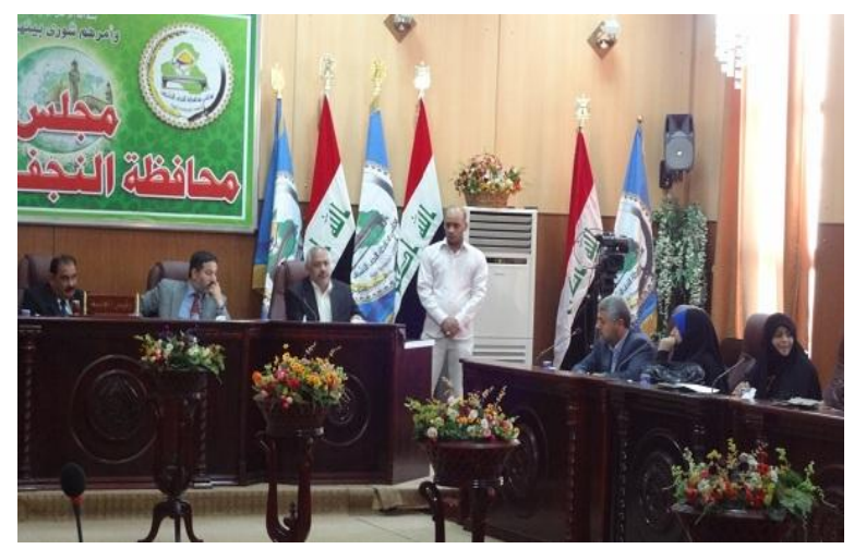
Najaf: 1st Public Dialogue 12 2012

report to be prepared by the monitoring teams, as well as the quality and depth of the information to be provided in the monthly reports.