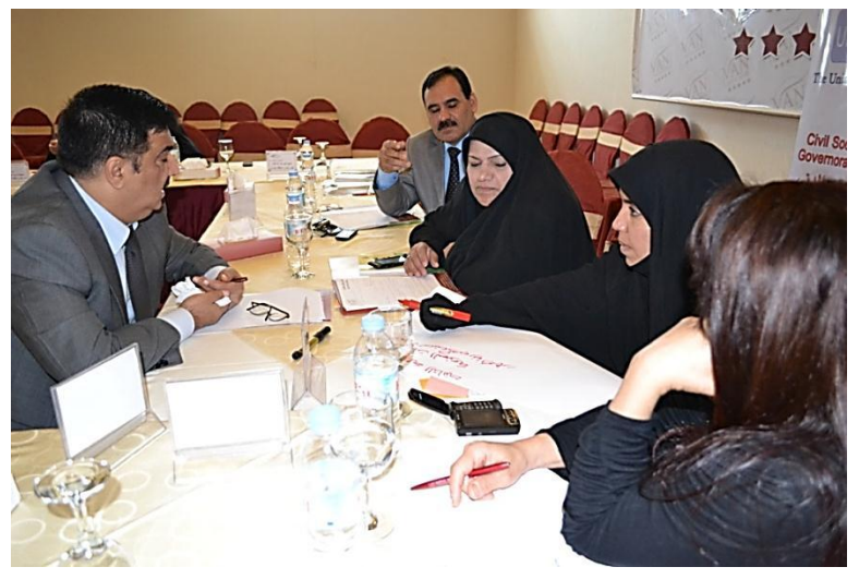
CSO Monitor Training: Small Group

speak truth to power". They provide careful appraisal of the а performance of the GCs. highlighting many deficiencies in procedure, while also assessing the capacity or willingness of the Councils to use the powers granted to them under law to formulate legislation and hold the executive accountable, and their ability to make decisions. In addition, the reports focused on public satisfaction (or the lack of it) with GC performance, while also appraising efforts made by the GCs at transparency and communicating with the public.