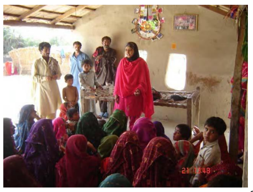
A community gathering

Second, AWLS has documented a significant increase in knowledge related to democracy and women's rights for participants in their community meetings, of which there were over 100,000. Third, resolutions were signed after each meeting pledging attendees to support women's political participation—this is a concrete outcome, symbolically important, which may be drawn upon in future to encourage support for women's rights. Fourth, although numbers were not available to the evaluators, there was a reported large increase in the number of registered voters, especially women. Finally, through the course of the project, extensive lists of unregistered voters were prepared, with a commitment to help these individuals get their CNICs—a prerequisite for voting.