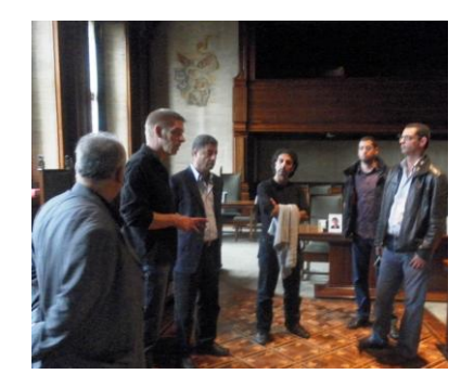
Visit to the municipal offices of Leiden

The idea of the visit was conceptually sound, however the limitations imposed by the social and political realities of life in Palestine imposed severe restrictions on the possible candidates for the two places available: the "visitors" were all male because it would not have been possible for a female student to go on the visit