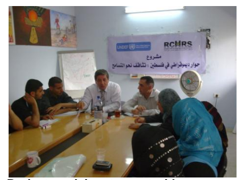
Project participants meet with a decision maker in Gaza

One of the participants in the project has since become a trainer specializing in democracy and tolerance; a female participant is now teaching human rights. Using social media to organize his